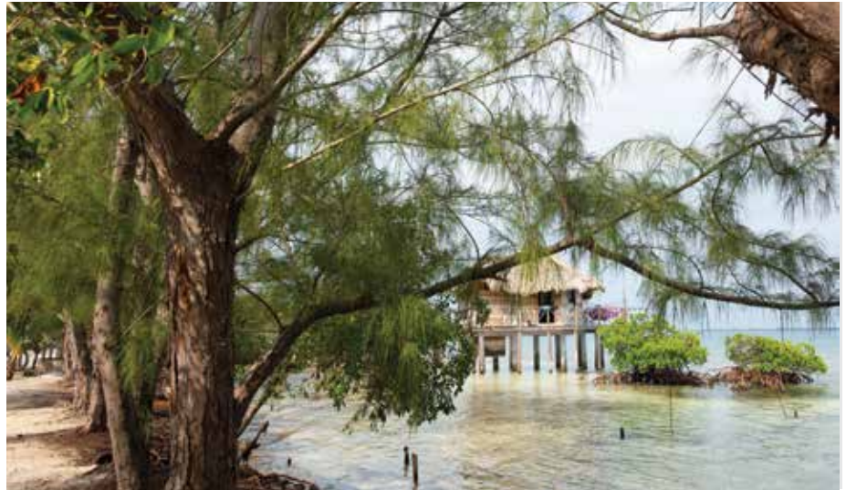
Getting away from it all at Thatch Caye

For that is the chief characteristic of this country despite allures that range