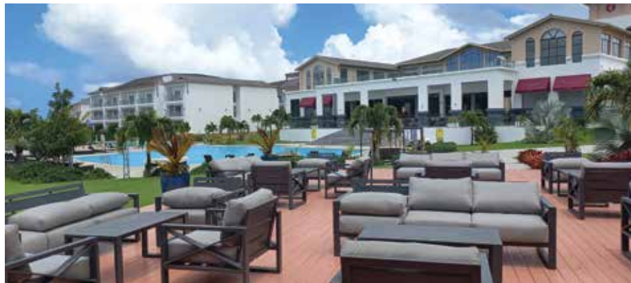
Ramada by Wyndham St. Kitts

Plans are in the pipeline for the expansion of the R. L. Bradshaw International Airport and the build-