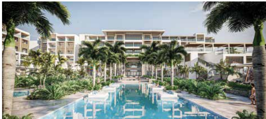
A rendering of the InterContinental Grenada Resort

The 150-room InterContinental Grenada Resort in La Sagesse, currently under construction, is scheduled to open in 2025.