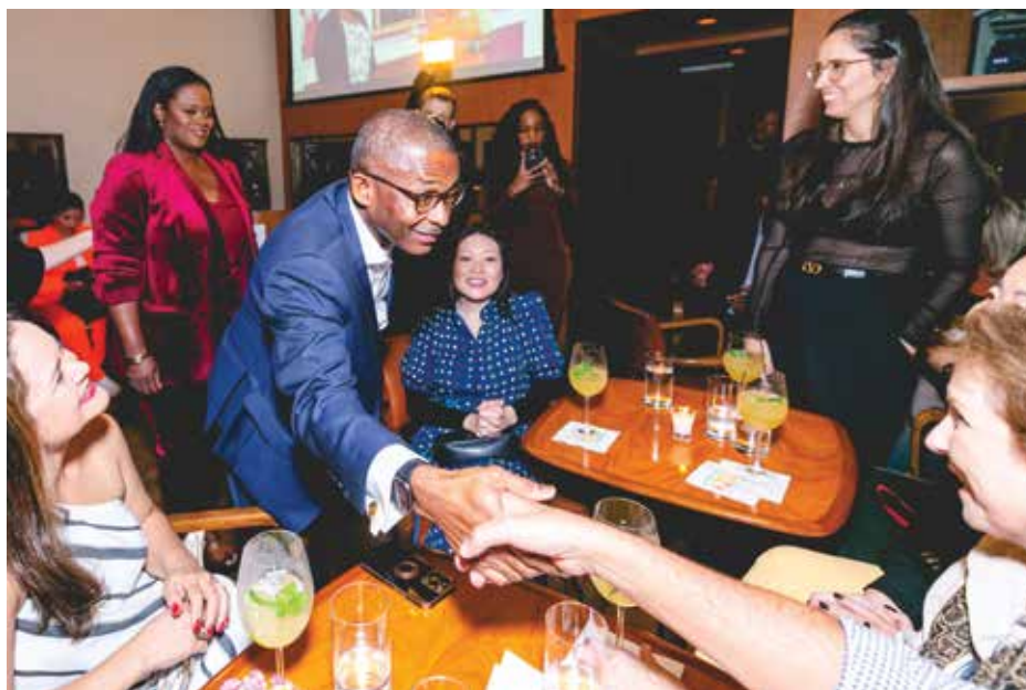
Minister Ian Gooding-Edghill with guests at the Barbados Food & Rum Festival.

He also pointed to real estate investment opportunities, noting that Barbados has a lot of coastal land left for hotel development particularly on the west coast of the island. There are also options for villa construction inland as well as opportunities for novel and different attractions and new restaurants.