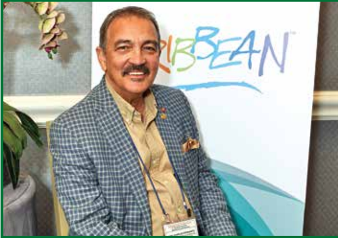
Antigua and Barbuda's Tourism Minister Charles "Max" Fernandez.