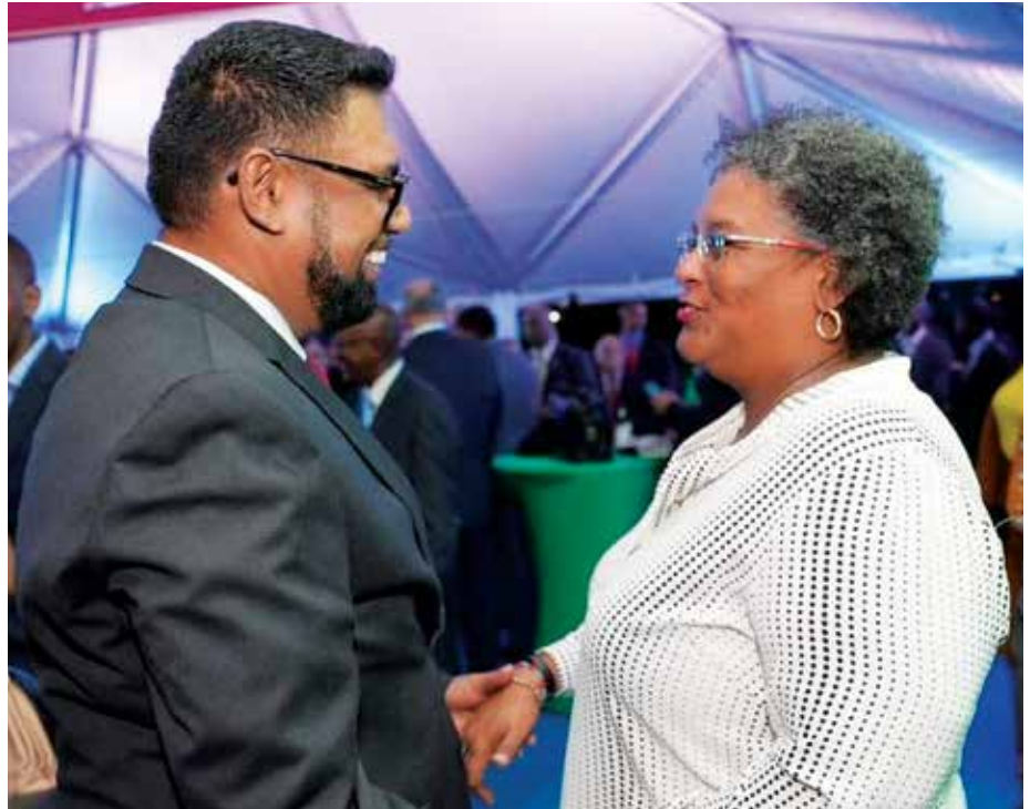
President Ali with Barbados Prime Minister Mia Mottley

While oil is the prime driver of our economic growth, it does not obscure the relevance and contribution of the