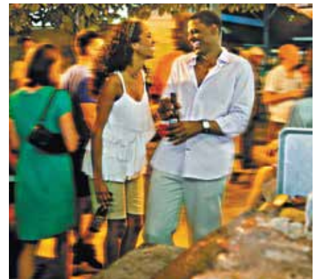
Patrons enjoying the Oistins Fish Fry

Barbados Minister of Tourism and International Transport Ian Gooding-Edghill, who attended the 2022 event for the first time as a Minister, said he was impressed with the Liquid Gold Feast Gala that takes place on the finale night. "For me what was a major take away is to see the local culinary talent at work and to see the mixologists at work and the fact that you could mix any beverage to an international standard including rum based cocktails. The fact that you can prepare food with all the local flair, that's one thing that stood out."