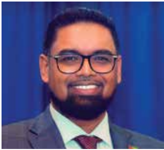
H.E. Mohamed Irfaan Ali