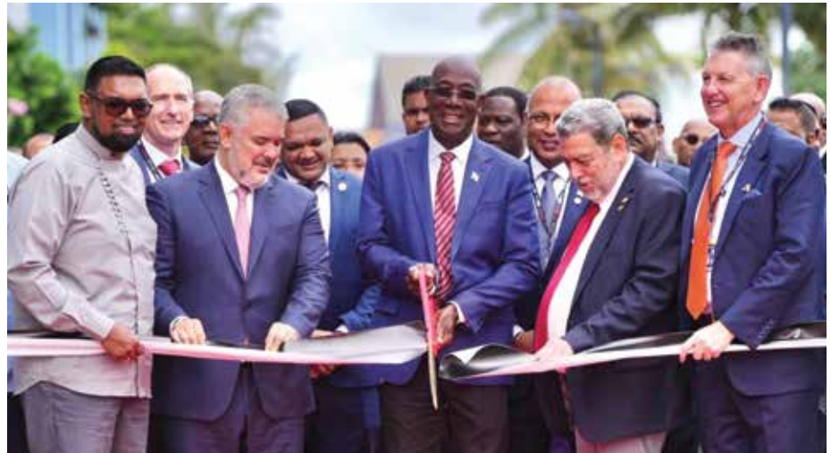
President Ali (at left) with other dignitaries at the International Energy Conference and Expo in Guyana. Cutting the ribbon is Trinidad and Tobago's Prime Minister Dr. Keith Rowley and to his right is Dr. Ralph Gonsalves, Prime Minister of St. Vincent and the Grenadines.

We have already seen the impact of our efforts in the form of record visitor arrivals.