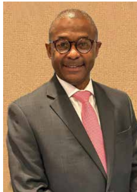
Ian Gooding-Edghill Minister of Tourism and International Transport

The Middle East is also a priority market for Barbados as the Minister believes it offers a unique opportunity for summer travel to the destination, which is traditionally low season. "Their summer is hotter than ours, they leave home during