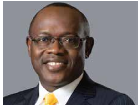
Chester Cooper The Bahamas Deputy Prime Minister and Minister of Tourism, Investments and Aviation

The Forum will host a diverse array of attendees, including companies