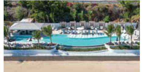
Frenchman's Reef Resort

The Hotel Development Program, which aims to increase the number of rooms available to visitors, was designed to assist with the development of new hotels, resorts, and related facilities in the USVI. To be eligible for funding, the project must be located on either St. Croix, St. John, or St. Thomas. Incentives can be combined with either the EDC tax