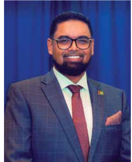
His Excellency Mohamed Irfaan Ali

Moreover, in response to exploration and development activity in oil and gas, several internationally recognised service providers to the industry have commenced operations here in Guyana, including Halliburton, Schlumberger and SBM Offshore.